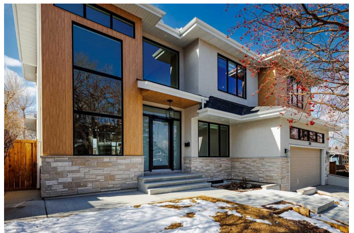
319 42 St SW, Calgary, AB