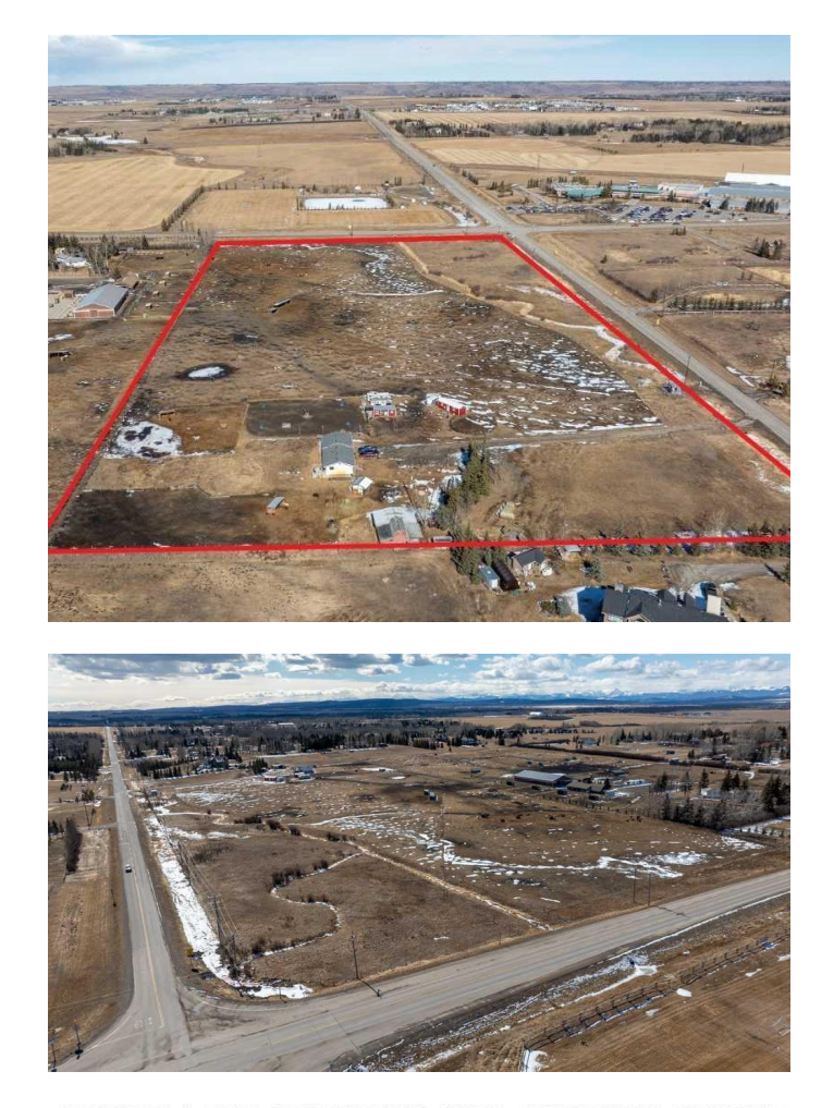
ALBERTA LAND SURVEYOR'S REAL PROPERTY REPORT

Offering of 19.2 Acres of development land located immediately SW of Springbank High School and the Springbank Park for All Seasons. Legal title of (East Â<sup>1</sup>/<sub>2</sub>) Subdivision 16 NE-21-24-03-05, owned by the existing family since 1960 and currently leased to a local horse operation. The current zoning designation is Residential, Rural District (R-RUR). In the Draft 2024 Springbank Area Structure Plan, this parcel of land has a future zoning as Infill Residential where future lots in the infill residential area will range between +0.8 to +1.6 ha (+2 to. +4 acres) in size, or whatever is most prevalent on adjacent lands or in the immediate area. This parcel can be serviced for water by CalAlta and the water line can be tied into at the Springbank High School hub. This has been confirmed to be within the CalAlta area for servicing. The cost to tie into this service can be discussed with CalAlta directly. The current owner attended 2024 Public Hearings for the Springbank Area Structure Plan and presented amendments to this particular parcel that they felt would enhance future development possibilities to this area and the Springbank community. A future owner may consider utilizing this parcel of land with its current land designation or may also consider working with a planning and independent consultant if they wish to apply to Rocky View County to change the land use designation, being that community and