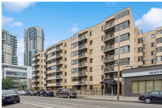
214 111 14 AVE SE - 06.12.2025 Main - 823.17 sq.ft / 76.47 m 2 RMS Area - 823.17 sq.ft / 76.47 m 2